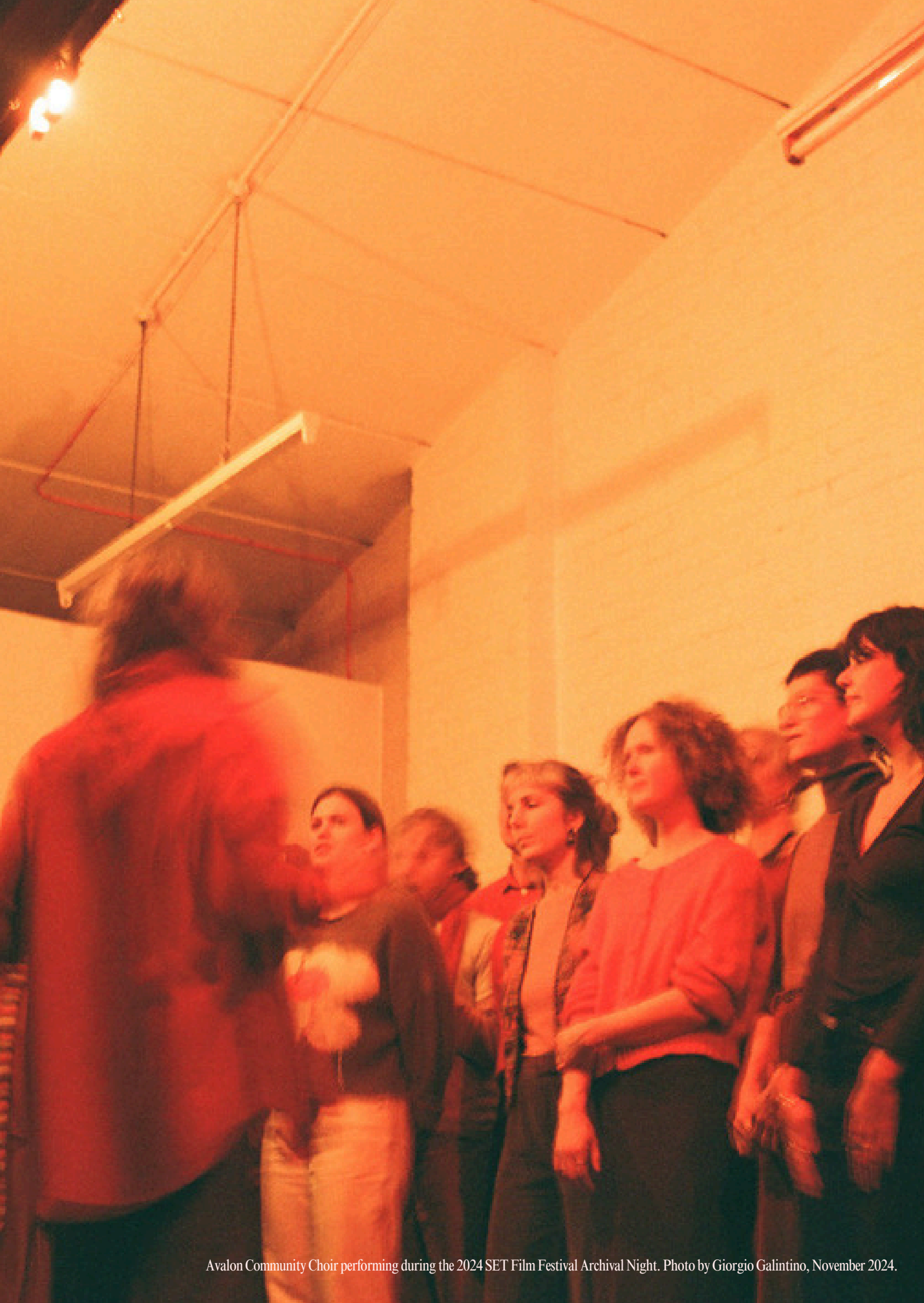
Avalon Community Choir performing during the 2024 SET Film Festival Archival Night. Photo by Giorgio Galantino, November 2024.