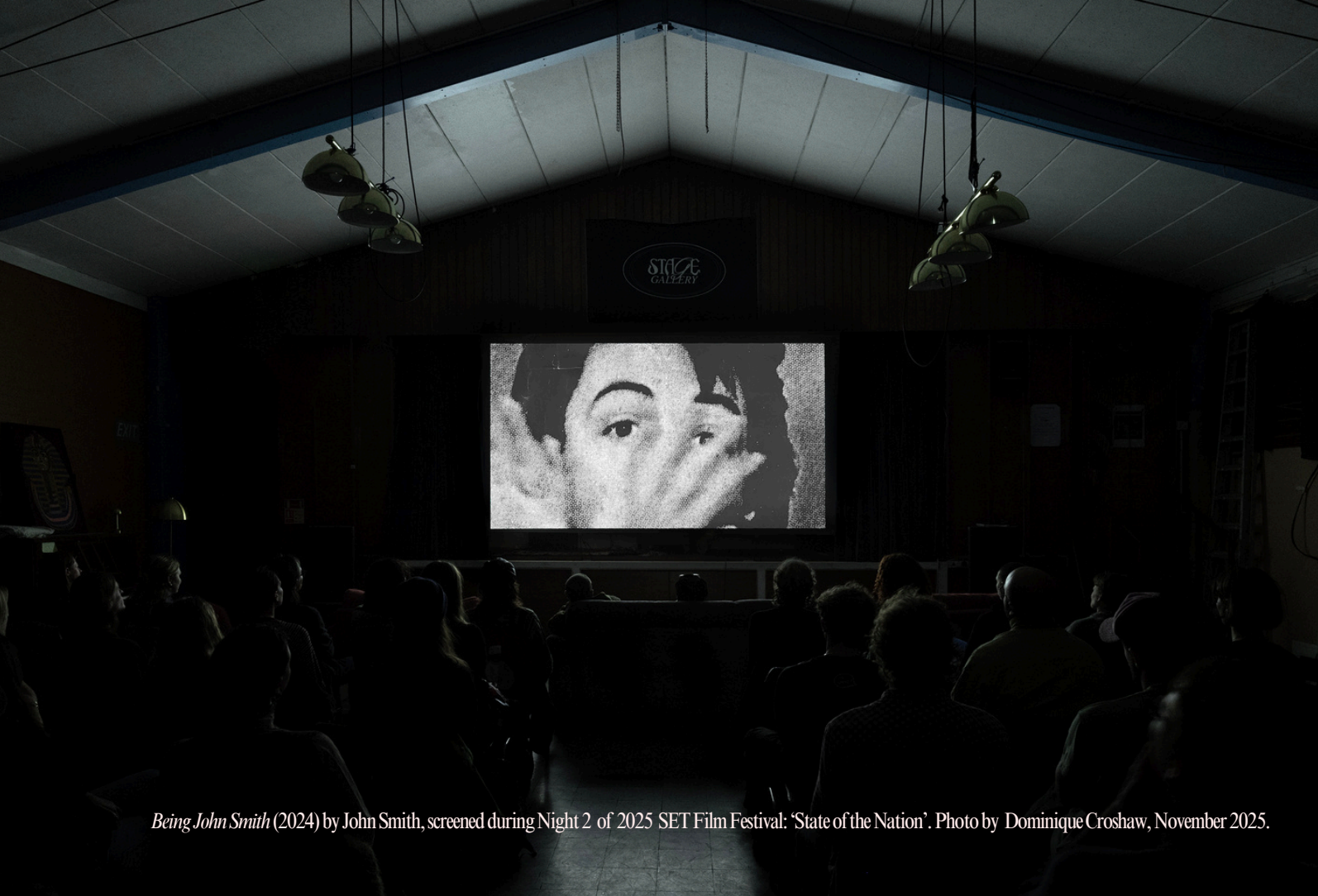
Being John Smith (2024) by John Smith, screened during Night 2 of 2025 SET Film Festival: 'State of the Nation'. Photo by Dominique Croshaw, November 2025.