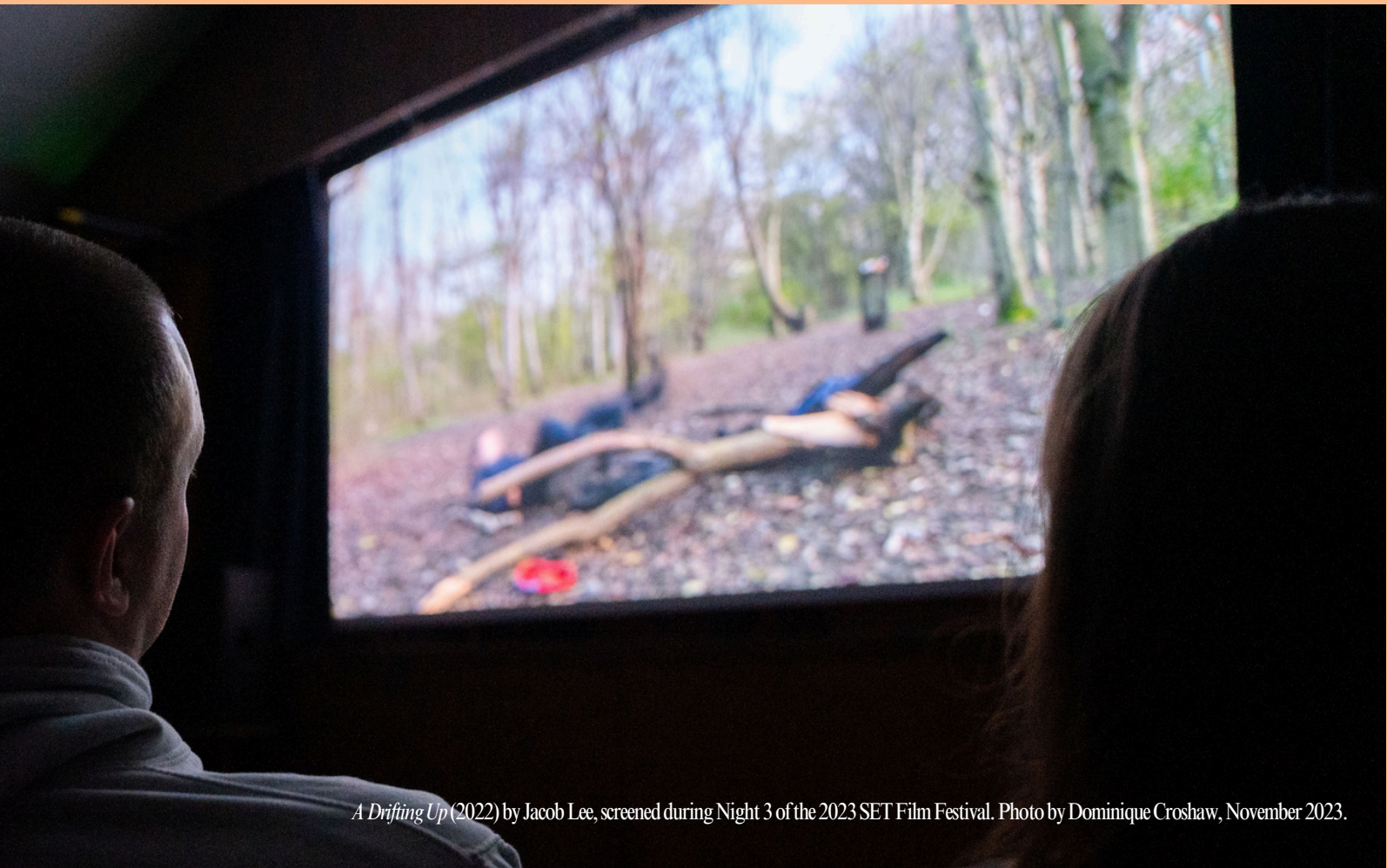
A Drifting Up (2022) by Jacob Lee, screened during Night 3 of the 2023 SET Film Festival. Photo by Dominique Croshaw, November 2023.

Selected films will be screened as part of the 2026 festival programme. Screening formats and scheduling are determined by the curatorial team. Filmmakers will be contacted directly regarding screening details, technical specifications and participation opportunities.