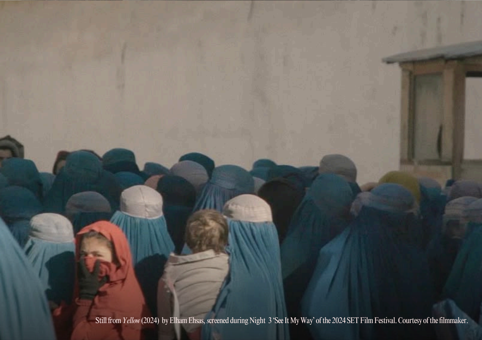
Still from Yellow (2024) by Elham Ehsas, screened during Night 3 'See It My Way' of the 2024 SET Film Festival.