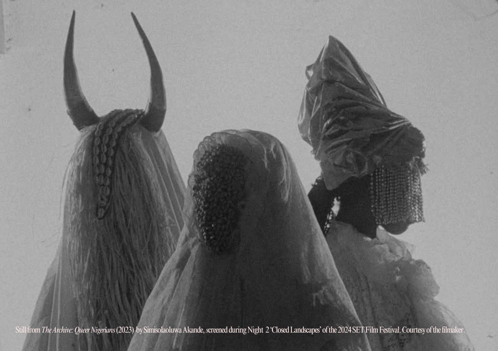
Still from The Archive: Queer Nigerians (2023) by Simisolaoluwa Akande, screened during Night 2 'Closed Landscapes' of the 2024 SET Film Festival.