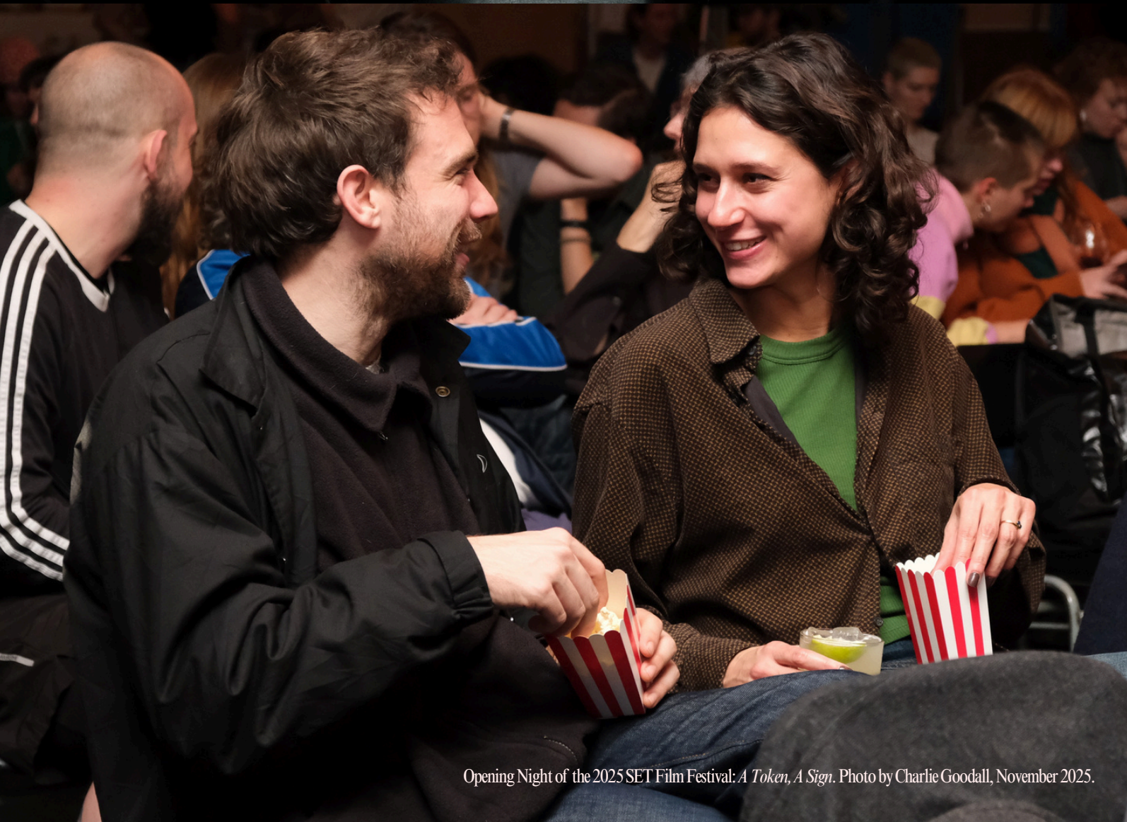
Opening Night of the 2025 SET Film Festival: A Token, A Sign . Photo by Charlie Goodall, November 2025.