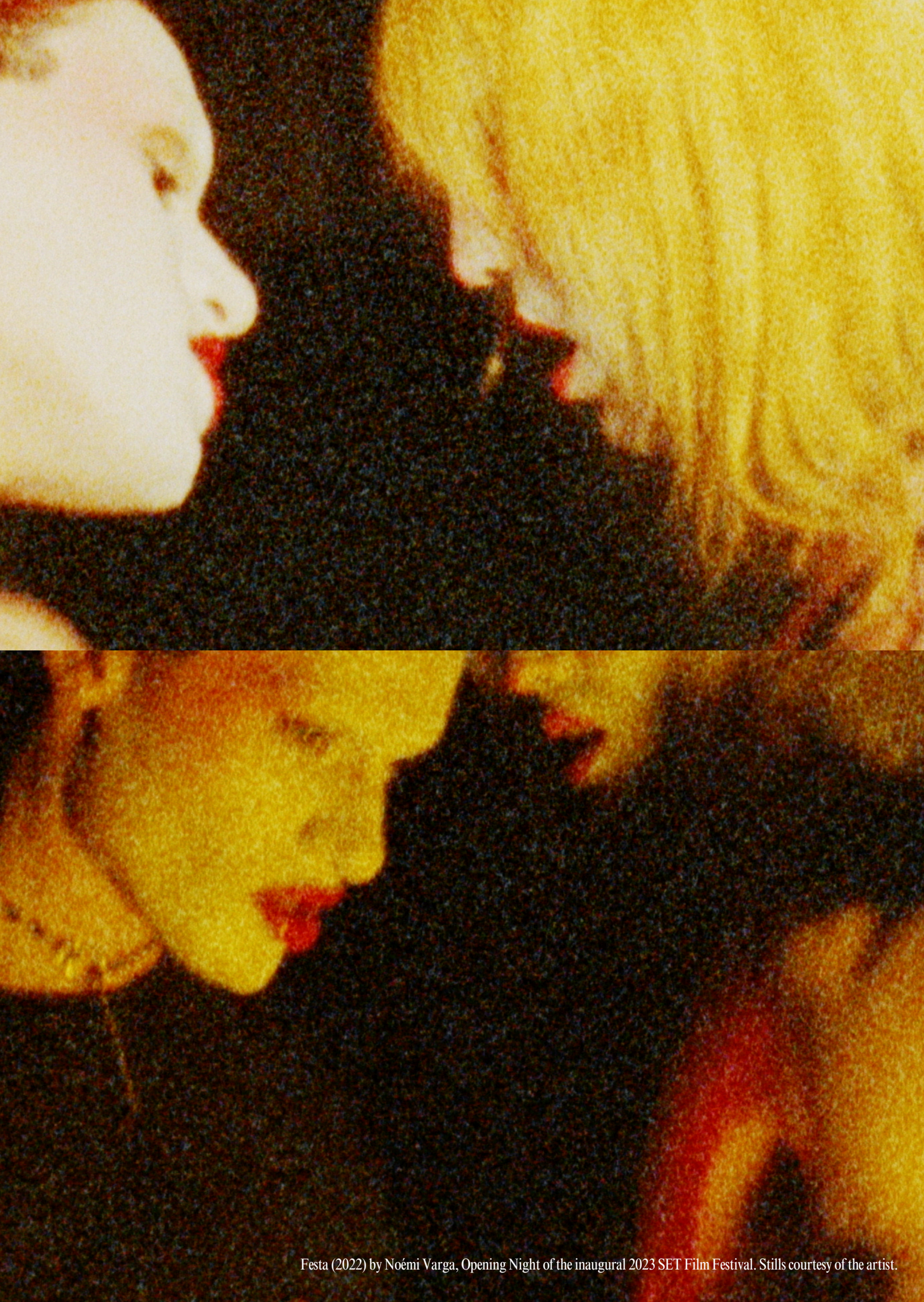
Festa (2022) by Noémi Varga, Opening Night of the inaugural 2023 SET Film Festival.